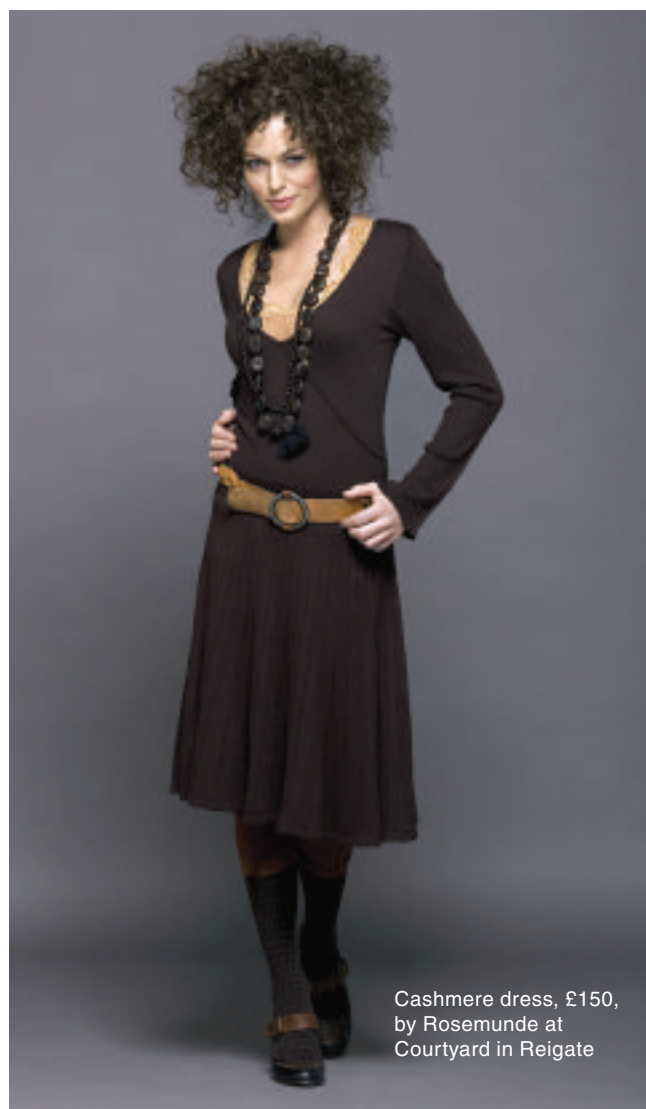
Cashmere dress, £150, by Rosemunde at Courtyard in Reigate